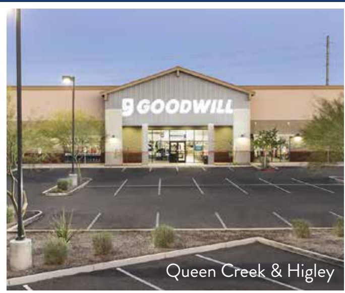
Queen Creek & Higley