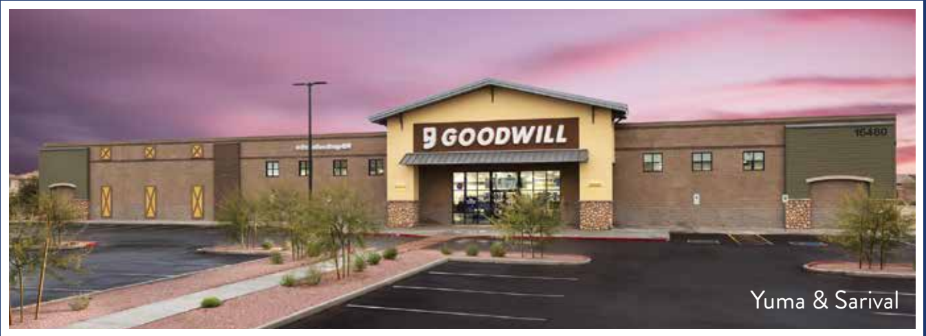
Yuma & Sarival

Goodwill of Central and Northern Arizona offers customers and donors a modern, clean and professional retail experience – starting with a welcoming exterior. Operations place an emphasis on productivity, efficiency and respect for our community partners, neighbors and customers.